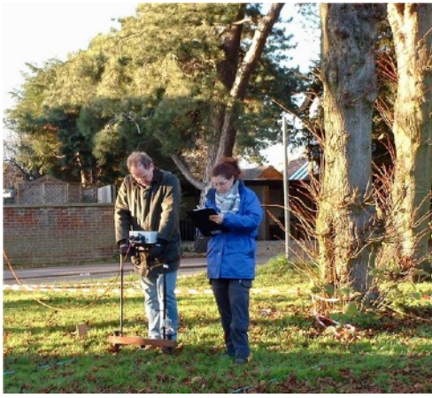
The resistivity survey underway in the churchyard, November 2004

The university downloaded and printed the results for us.