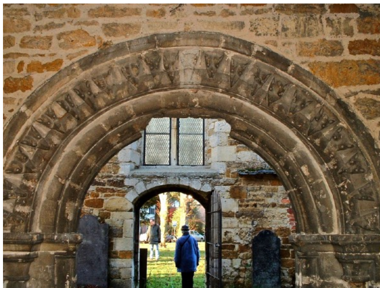
The beaked heads, dating from the Norman period, over the porch at St Mary in Arden November 2004

We would love to hear from anyone who thinks they can interpret the results.